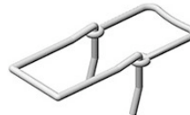
3/16" Hook & Eye