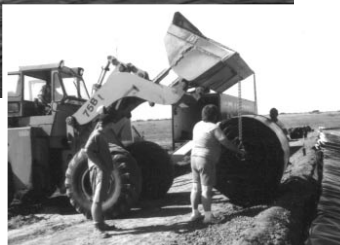
Large Factory Welded Panel