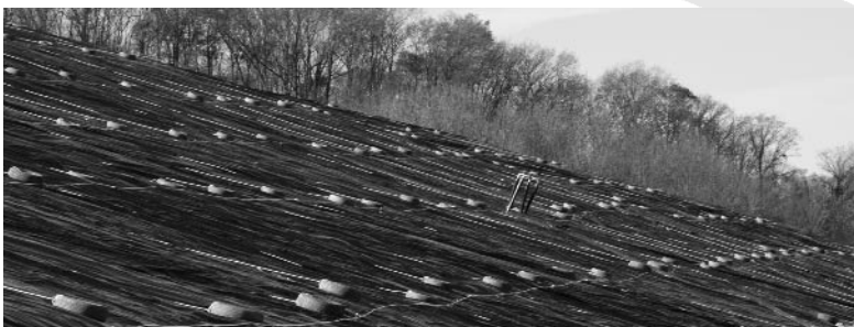
Temporary Rain Shed Cover

DURA-SKRIM 8BBR, 8WB, are available in a variety of widths up to 125,000 square feet and up to 80,000 square feet in 12BBR and 12WB . All panels are accordion folded and tightly rolled on a heavy-duty core for ease of handling and time saving installation.