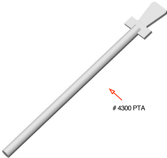
↗ # 4300 PTA